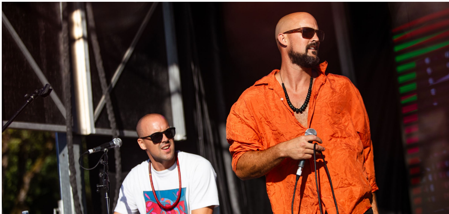
The Boom Booms